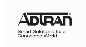
Positive black logo and tagline