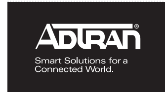
Reversed white logo and tagline

The corporate logo with tagline will always be displayed in color, in black or reversed out in white.