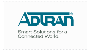
Positive teal logo with gray tagline