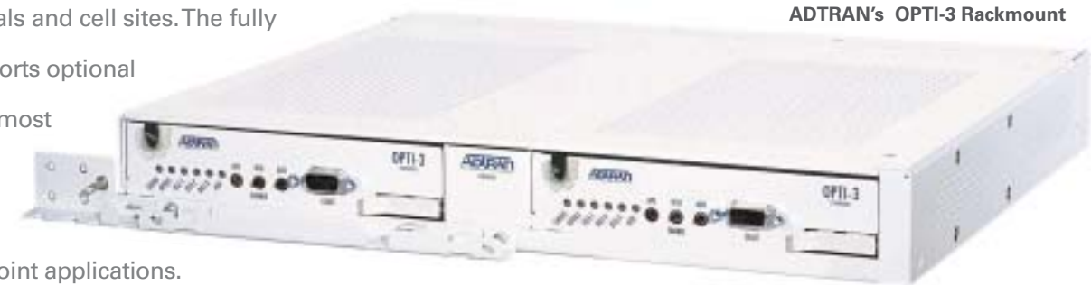
ADTRAN's OPTI-3 Rackmount

A carrier-class device, the OPTI-3 meets the needs of applications that require extended temperature range operation such as remote terminals and cell sites. The fully integrated design supports optional redundancy and is the most economical choice for both SONET ring delivery and point-to-point applications.