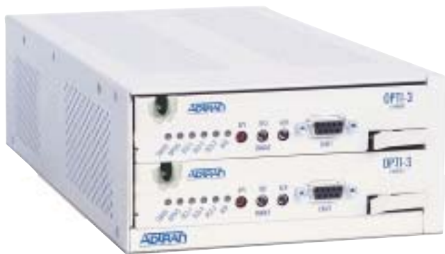
ADTRAN's OPTI-3 Wallmount

Service providers are often faced with challenges posed by the limited electrical range of DS3 and the cost of converting optical to electrical interfaces through expensive multiplexers. The growing demand for DS3 deployment and limited space availability in central offices and remote terminals presents an additional challenge. The ADTRAN® OPTI-3™