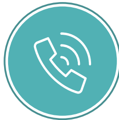
ProCloud Unified Communications