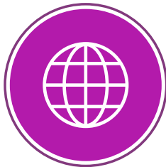
ProCloud Network Management

We have assembled and integrated a truly comprehensive and rich platform of IT cloud-hosted and managed solutions that creates value for service providers and a top-notch customer experience for users.